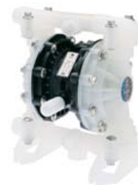
Husky 515, Poly

All written and visual data contained in this document are based on the latest product information available at the time of publication. Graco reserves the right to make changes at any time without notice.